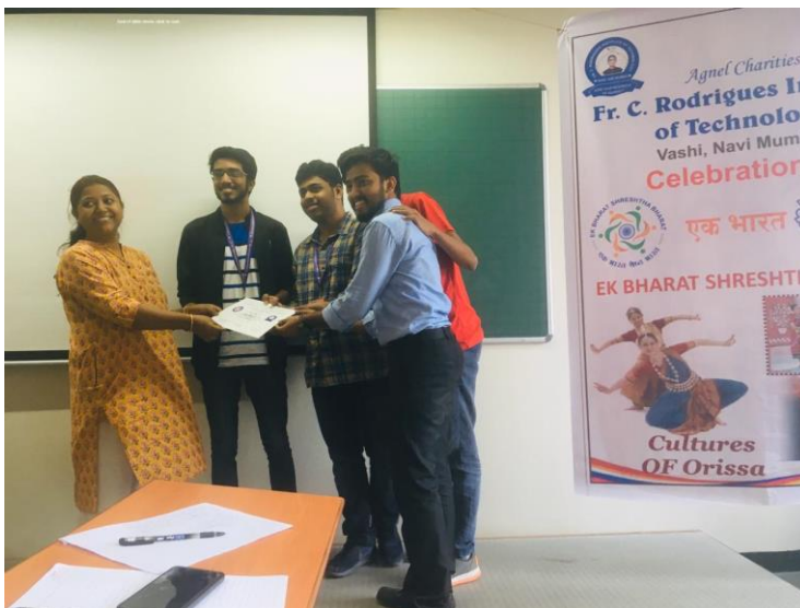
Winner team receiving the certificated by Guest