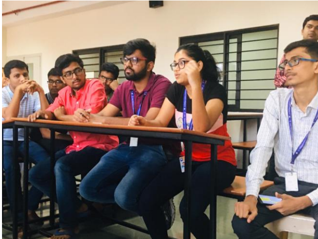
Team A of debate