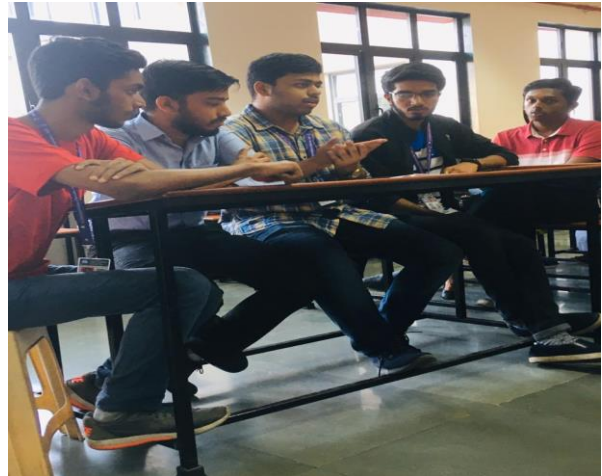
Team B of debate